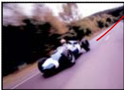
Real oil from a real car. Maybe this real car. Maybe not. Who cares?

old race cars are taken on public roads, to a surreal road test of the Bertone Mantide. You could dismiss Waf t as a load of guff. And mostly you'd be correct. But the pictures are unique and dramatic, it's artistically designed, the stories occasionally fascinating, and each cover features real engine oil, dripped onto canvas from an old race car. Don't believe us? Sniff it. £70 www.waft.be