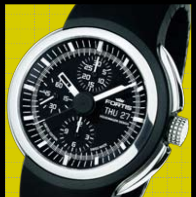
FORTIS SPACELEADER By Volkswagen Design £2,000 fortis-watches.com