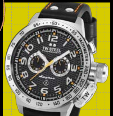
TW STEEL TW661 Inspired by Spyker cars £475 twsteeluk.com