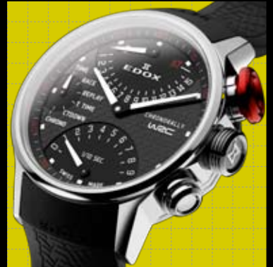
EDOX CHRONORALLY Official time-keepers of the WRC £1,566 edox.ch