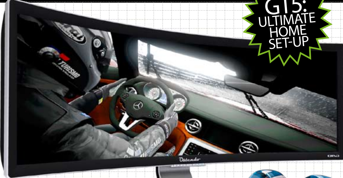
OSTENDO 43-INCH CURVED SCREEN The ultimate monitor £4,100 crvd.com