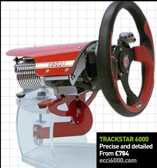
TRACKSTAR 6000 Precise and detailed From £784 ecc6000.com