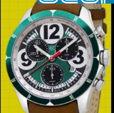
CHRISTOPHER WARD C70 DBR1. Inspired by Aston £325 christopherward.co.uk