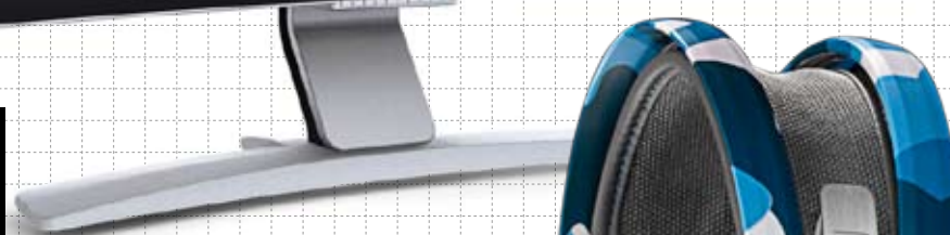
AKG GHS-1 Designed specifically for gaming audio £86 akg.com